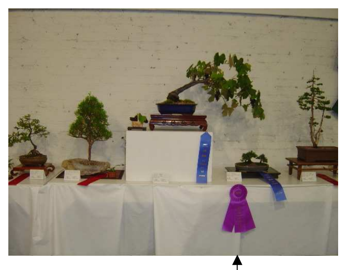
Display from State Fair Show -

I'm very sorry, but I lost my paper with who worked at the novice classes. Can you contact me if and how many times you worked? Thanks. Kris