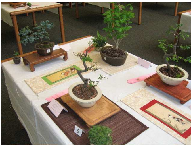
Trees from the Mahone Bonsai Club Show in May