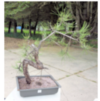
Ponderosa Pine before Suthin styled

We are honored to have him and his workshop should not be missed. Workshop dates are Saturday and Sunday July 16 and 17th (private dates are also available). Follow-up workshop dates are scheduled in September. More on that later. Cost is the same as previous years $80 a day per person. Sign up at the next meeting or call Pam at 352-7799.