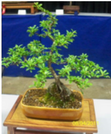
Hinoki Cypress (A)