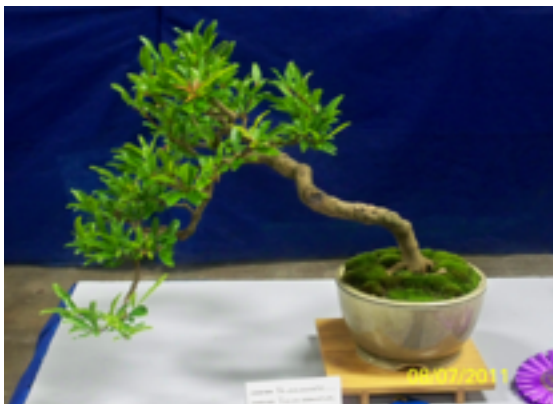
Pomegranate (I) - Greg P