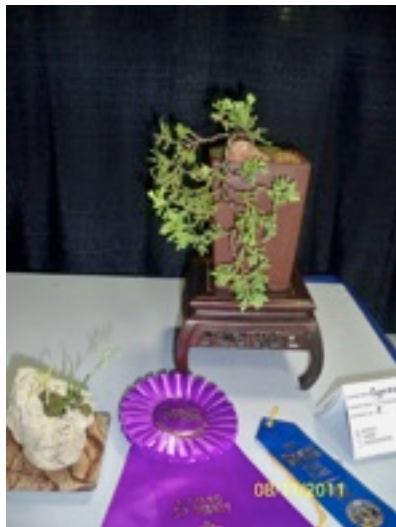
Cypress Cascade (N) - Barb S