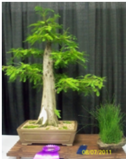
Bald Cypress (O) - Ron F