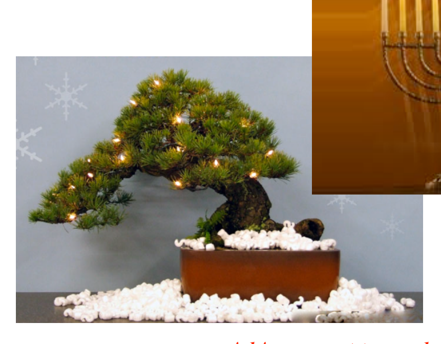
Wishing you a Merry Christmas and a Happy Hannukah