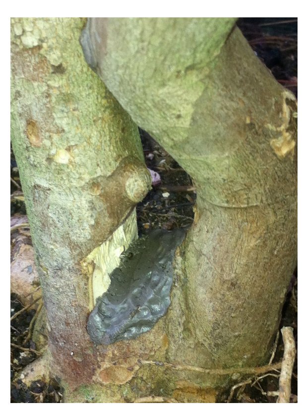
Calluses - Part 3 next month on conifers