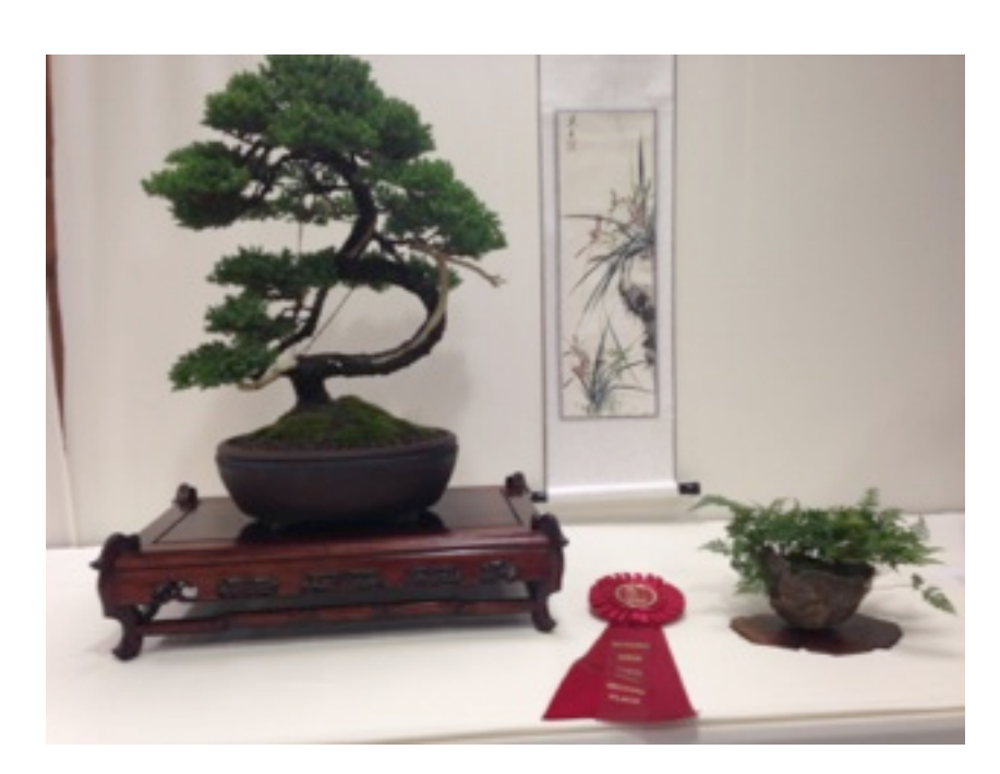
2ND PLACE Japanese Garden Juniper (I) - Judy H