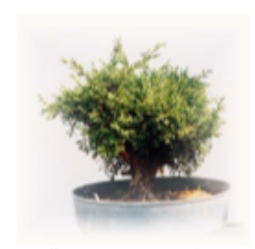
5 gallon pot summer 1995

We have openings left in our Saturday October 4 all day workshop. Both Sunday and Monday are filled. If you cannot attend that be sure to be wowed as Suthin updates our two club trees at our October 7 general meeting at 6:45. One he started in 2009 and the other in 2010. He has been working on both of these trees periodically since the original stylings.