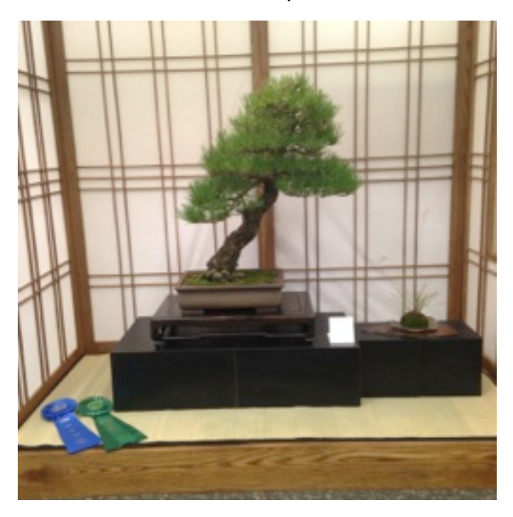
1ST PLACE & BEST OF SHOW Japanese Black Pine (O) - Jack D

Judge: Colin Lewis Open (O), Intermediate (I), Novice (N)