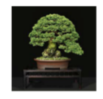
A great example of his work