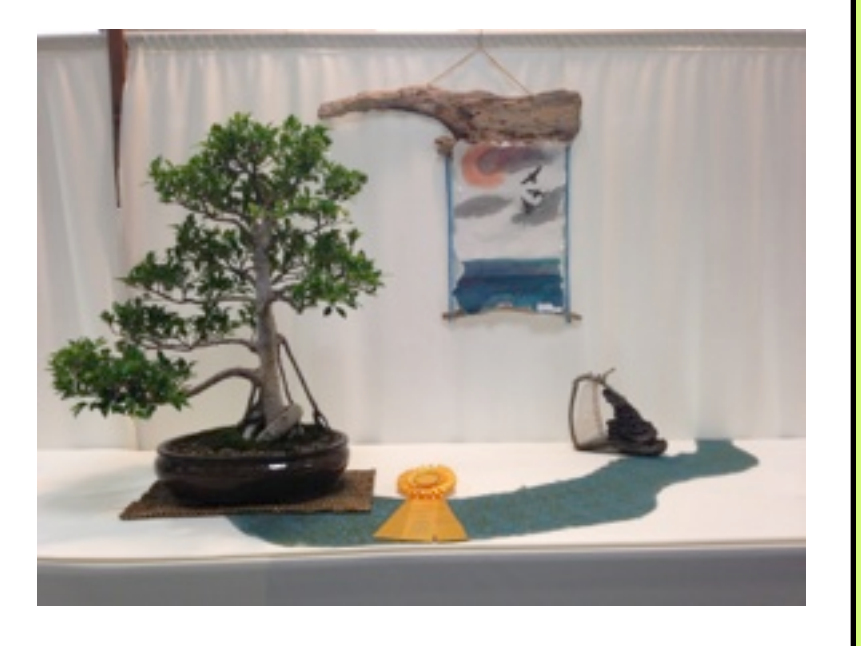
3RD PLACE Tiger Bark Ficus (N) - Kevin S