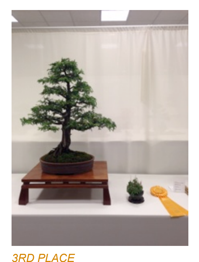
Eastern White Cedar (O) - Pam W