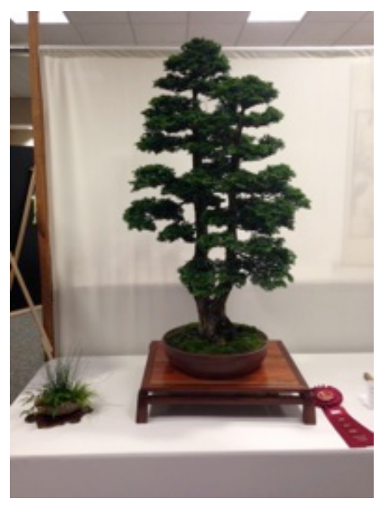
2ND PLACE AND PEOPLE'S CHOICE Hinoki Cypress (O) - Michelle Z