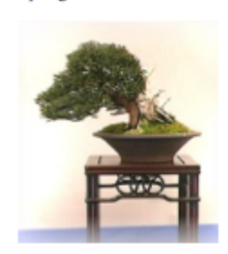
After 2 years of careful pinching Nov 2000