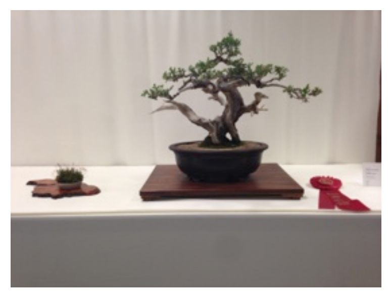
2ND PLACE Creeping Juniper (N) - Liza W