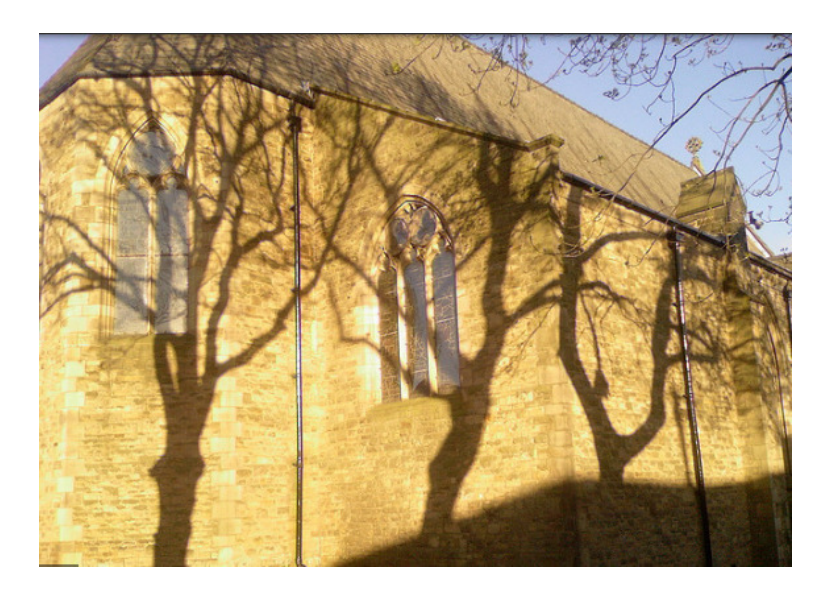
Shadows on the wall Images without blemish Moving with the sun ~Joe N.