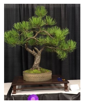
Ponderosa Pine—Ron F