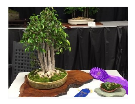
Little leaf Ficus—Steve Ca