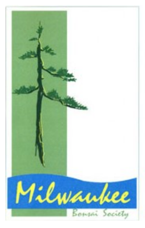
PO Box 240822 Milwaukee, WI 53224 Www.milwaukeebonsai.org RETURN SERVICE REQUESTED

Next MBS meeting will be March 6, 2018 at 6:45pm Boerner Botanical Gardens 9400 Boerner Dr Hales Corners, WI 53130