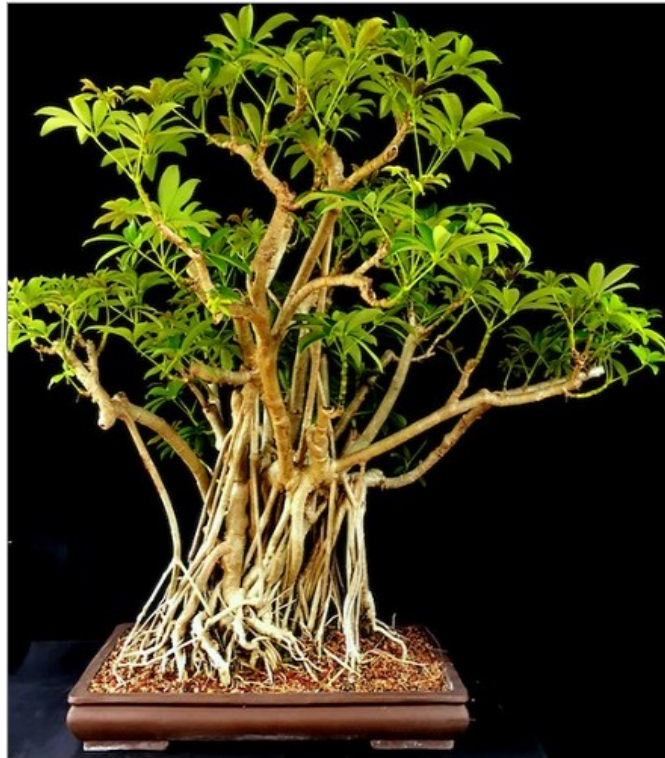
Hawaiian Umbrella Schefflera

There is a public workshop at Lynden Sculpture garden on June 15 from 10 am until 1 pm. Volunteers are needed to work with the participants. We will be styling and repotting dwarf schefflera's from Wiegerts Bonsai Nursery. We are anticipating 10 people in the workshop so we could use at least 5 people to help. It is a great opportunity to spread the word about bonsai to new people and have fun at the same time. Contact Jack at jack.douthitt@gmail.com to sign up.