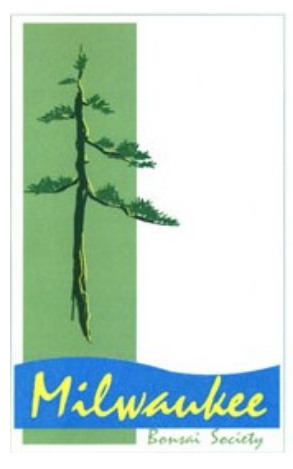
PO Box 240822 Milwaukee, WI 53224 Www.milwaukeebonsai.org RETURN SERVICE REQUESTED

Next MBS meeting will be Sept 3, 2019 at 6:45pm Boerner Botanical Gardens 9400 Boerner Dr Hales Corners, WI 53130