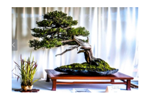
Best in Show