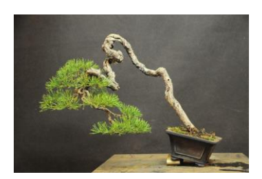
Scots pine that is ready for repotting because of the angle of the tree.

Use repotting to attain your bonsai goals.