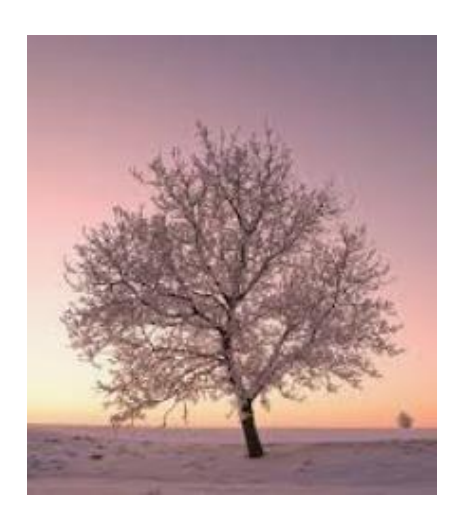
An icy wind blows The tree is lonely and cold Its branches are bare