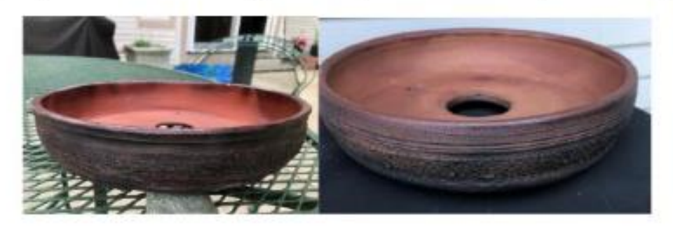
Get ready for repotting season