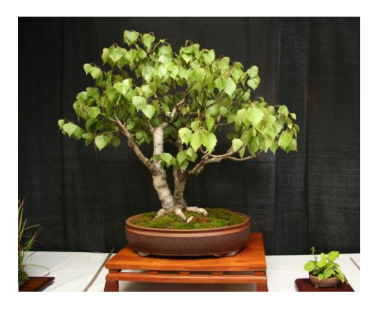
This Birch Bonsai Collected in Upper Michigan in a rundown golf course in 1995. Displayed at the National Exhibit in 2023 by the author.

There are many abused trees in either commercial landscapes or neglected home plantings.