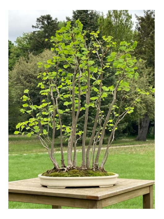
This Ginko grove is one of the Bonsai on exhibit at LSG. All trees for this grove were collected in Bay View area as part of an MBS club dig in2010.