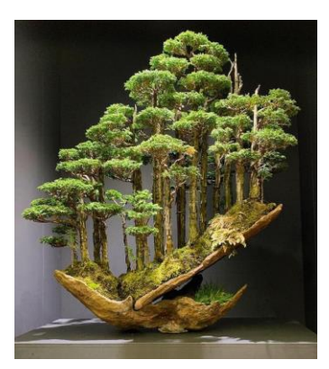
One of the most famous forest Bonsai, by Masahiko Kimura.